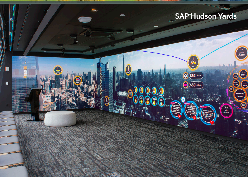
SAP Hudson Yards