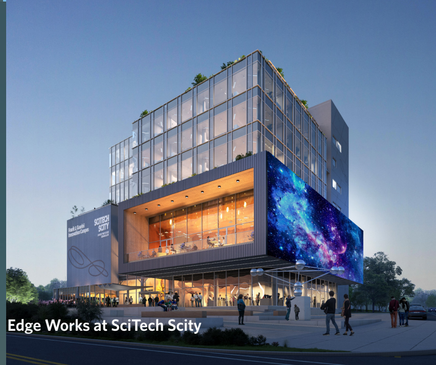
Edge Works at SciTech Scity