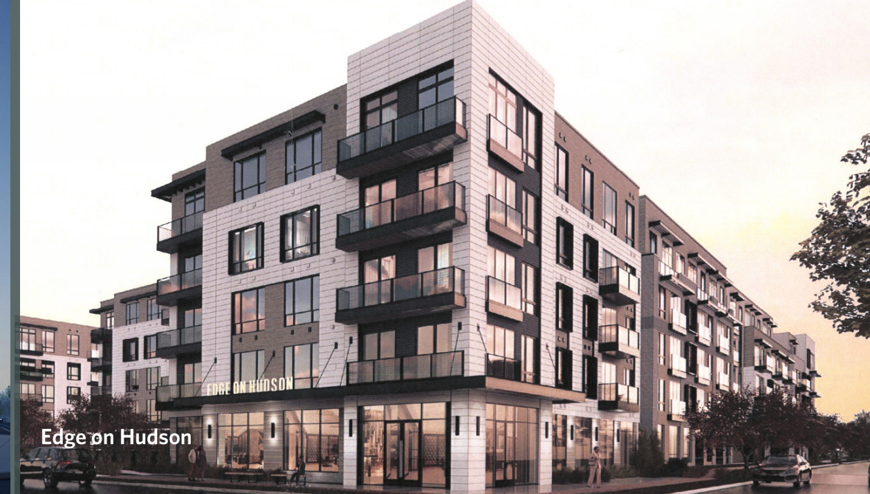
Edge on Hudson